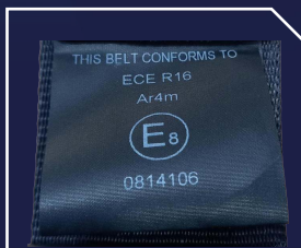
ECE R16 Road Approved

TRS specialise in volume manufacturing in our British factory under ISO 9001 quality control. Full factory support includes prototype design, bespoke manufacturing, customer stock holding and quick dispatch.