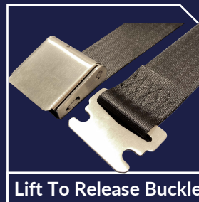
Lift To Release Buckle

TRS Motorsport (Part of Certex UK), Unit C1, Harworth Industrial Estate, Bryans Close, Harworth, Doncaster, DN11 8RY Tel: + 44 (0) 1302 750800 Email: sales@trs-motorsport.com