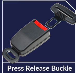
Press Release Buckle