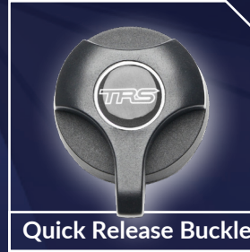
Quick Release Buckle

Using a TRS safety harness ensures that the offshore transportation of crew on work transfer vessels can be done safely and comfortably.